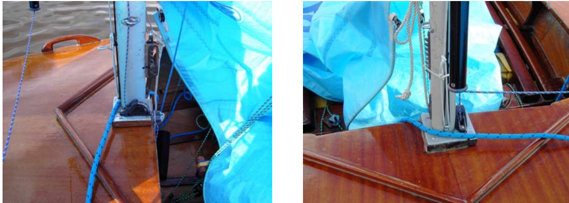
Figure 14: Alternative deck mounted control line system - Clamcleat® fitted with keeper and cage on a conventional mast step. There is enough space between the Clamcleat® and the mast for a Highfield lever cover. The mast step has been extended in width by 2cms to prevent snagging with the jib sheets. (This boat is 40 years old, and in deference to its construction the kicker is led back to the forward thwart because there is no central knee on the side seat.)

engaging) and a cage (CL816, to allow operation from extreme angles) is required. These additional fittings bring the width up to 29mm (at its widest point), and hence a maximum overhang of 6mm. Thus whilst the Clamcleat® can be screwed to a conventional step, an extra piece is required to prevent any snagging with the jib sheets. This arrangement is shown in figure 14.