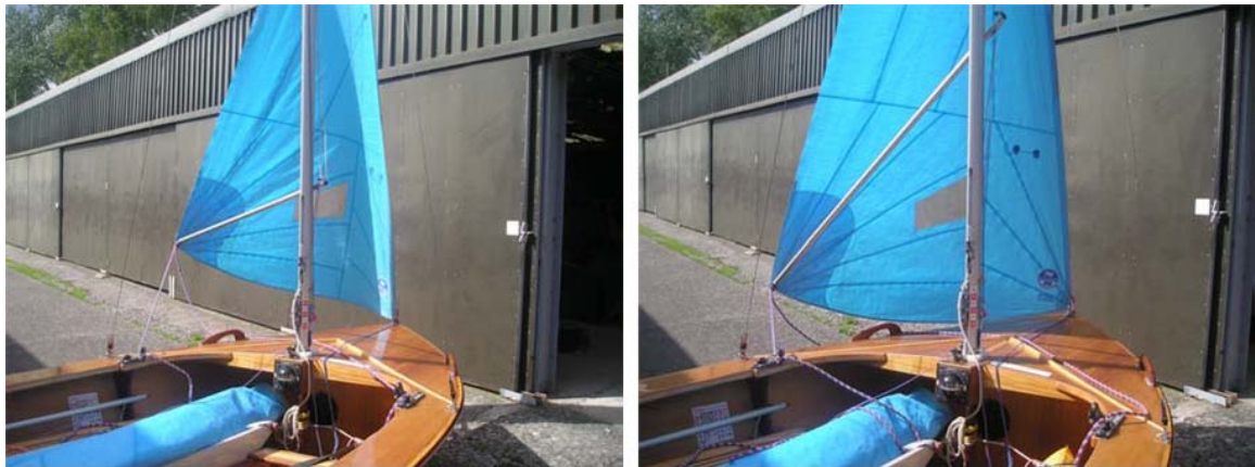
Figure 12:- Pole deployed on a run (left) and on a reach (right).