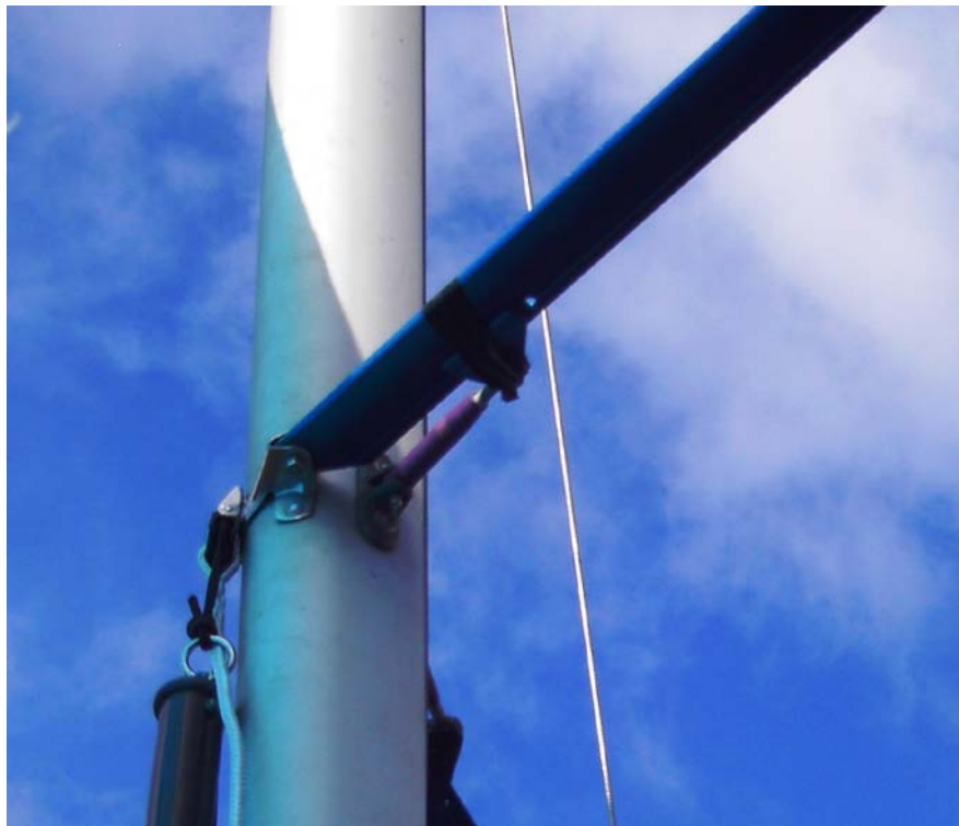
Figure 7: Holt cheek block HA2026 fitted on older mast* just above spreader bracket with spacer to raise block plate to same level as spreader. (*no central rivet on Spreader) Ring is attached to pole by 3mm rope (blue) and black bungee cord which runs through block.