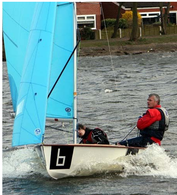
Figure 7: The pole in action on 23131, which has the same setup as Steve's boat.

Applying the pole on a run for goosewinging. Let the helm pull quickly on the jib sheet, and then let go while the pole is being pulled down. This is the quickest method of applying the pole. As soon as the pole is out you can cleat the jib.