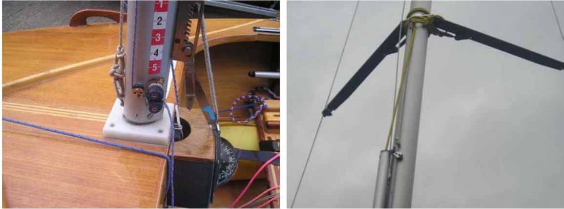
Figure 11: Control line led through small block to cam cleat on side of mast. Pole runs up line on front of mast on a pulley.

This next section is lifted from Alan Hamilton's Bristol Corinthian Enterprise Fleet Newsletter. The notes on the rigging of the flyaway pole were written by Bryan Smith.