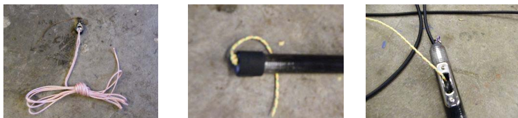
Figure 5: Holt cheek block and spliced Dyneema, Top end of the pole (HA421), Harken thru deck block £24.01. Attach yellow sheet through the block this will become your downhaul.