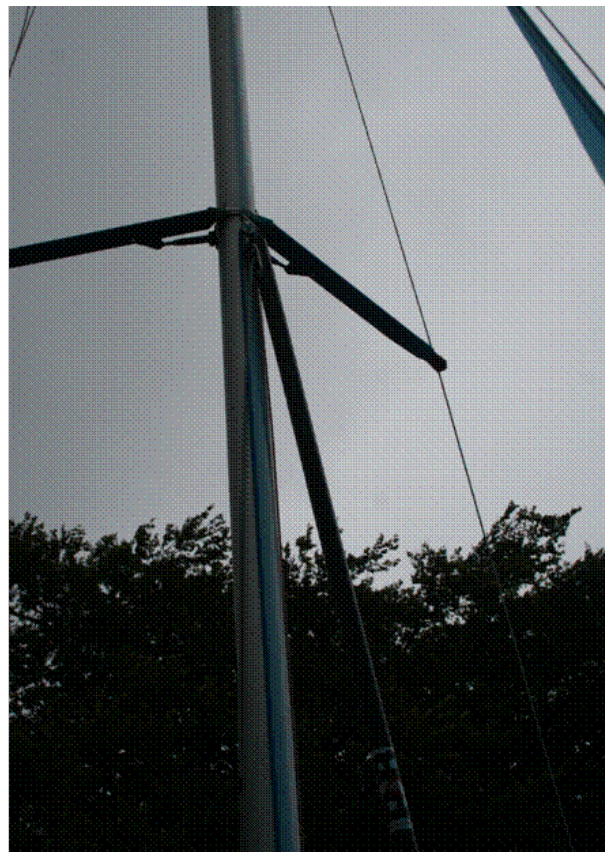
Figure 13: Deck mounted system with (white) control line led through Harken block and cam cleat. Red rope running line. Control pulley line and bungee attached to spreader bracket.

P&B have produced an excellent illustrated description of a deck systems produced which can be viewed by clicking on the attached Acrobat document or going to this link .