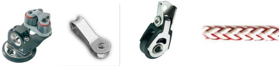
Figure 3: Ronstan "mainsheet" jammer RF67, RWO clip eye mount R2849, Holt cheek block HA2026, and red Excel D12

5mm x 5m of elastic, 3mm - 3m of Dyneema , Excel D12 (red) £5.82, and 3mm x 5m of yellow sheet. Total price £212.60 inc vat.