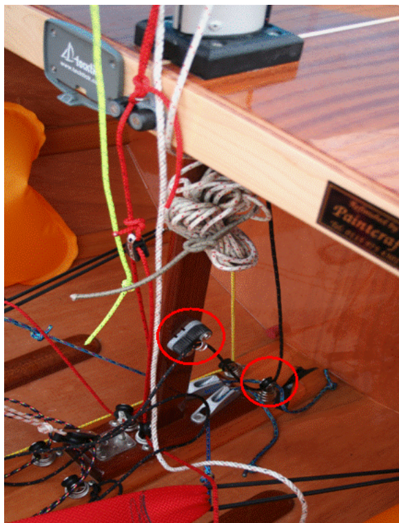
Figure 10:- Below deck workings of a through the deck system

Figure 10 shows the below deck workings with a pulley on the hog and control line (black) led back to cam cleat on king post. The yellow running line can be easily tensioned if it becomes slack. An alternative control line arrangement is to have a swiveling cam cleat and block mounted on the aft side of the kingpost.