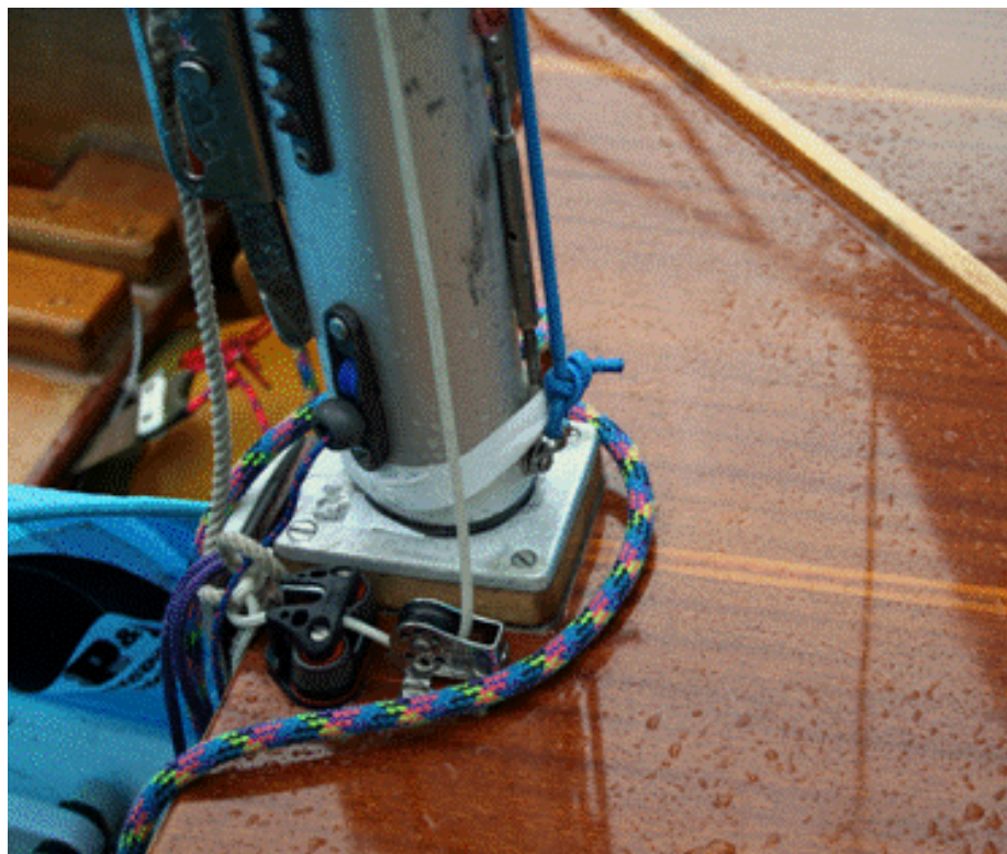
Figure 13:- Harken ball bearing block securely fixed to deck with line led to cam cleat fitted with cage. Bottle screw used to tension running line.