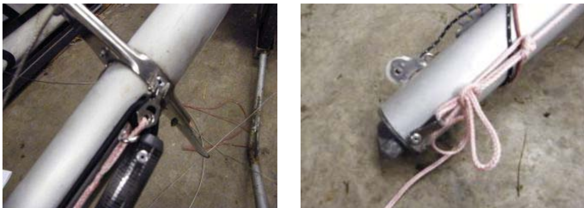
Figure 4: Holt cheek block attached to centre of spreader bracket with spliced Dyneema fastened tightly to clip eye at base of mast

The big plus with this kit is that all the hard work is done for you. No connecting the rope through the pole and only a little drilling to attach the fittings to the mast. When attaching to the mast, you will need a drill, rivet gun and patience. Drill out the rivet in the middle of the spreader and attach the dynamic cheek block with a new rivet. Drill out rivet at bottom of mast and attach the clip eye with a new rivet (figure 3). Pull the rope that is spliced onto the "spreader" block tight and tie onto the clip eye (figure 4).