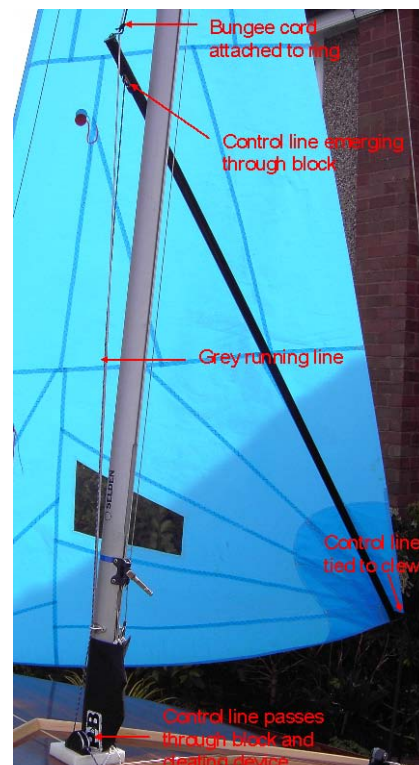
Figure 1: General view of pole and control and running lines.

The pole system is composed of a number of components (see fig 1). They are described briefly here and in greater detail later in this document. The pole is a hollow carbon fibre or alloy tube 2 meters in length. The inboard end of the pole is attached to a ring which runs on a line stretched between the spreaders and the foot of the mast. The outboard end is attached to the jib clew by a line which runs through the pole to a block fitted about 3" from the other end. This line controls the angle of the pole. Pulling the control line moves the inboard end of the pole down the running line, and pushes the pole until the outboard end meets the jib clew. Releasing the tension from the control line disengages the pole, and the inboard end of the pole is pulled up towards the