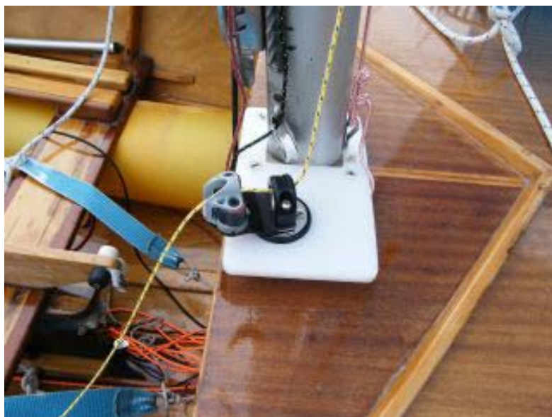
Figure 2: Plastic board screwed onto the mast step with Ronstan swivelling bulls eye and cleat attached. Notice the hole cut to accommodate the mast.

As I didn't want to screw cleats the foredeck I had to think of an efficient and secure system that did not damage the deck. My arrangement meets these criteria, and what's more it's cheap!! I bought a 1cm thick white plastic chopping board from M&S (cost <£5). Anything less than 1cm thick may not be sufficiently robust. The board was cut to the size of two mast steps, and a hole cut through the left hand section to accommodate the mast. Holes were drilled in four positions at the corners of "the mast hole" so the shaped board could be screwed to the mast step. On the other side (right hand) I fastened a Ronstan mainsheet jammer (RF67). This consists of a bullseye on a swiveling base with an integral jammer for 2-6mm diameter line (cost about £40). See figure 1 for a photograph of the fittings in place on my boat.